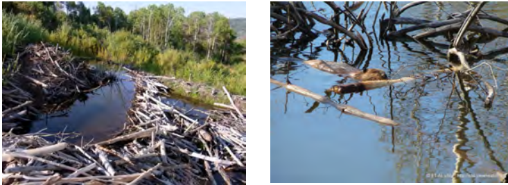
A beaver dam located in the Temple Fork Watershed, Logan Canyon, Utah.

In Figure 2, an example is shown within the Temple Fork watershed in northern Utah comparing actual dam densities to the BRAT capacity model. The model is able to discriminate areas that have no history of beaver dams from those with occasional dams and from those that support major dam complexes and colonies. Interestingly, the model picked up a high capacity not only for a long-term dam complex that has persisted for at least the past 50 years, but also a brand new dam complex. The new dam complex was constructed by beaver thought to be displaced by a 2011 flood. The beavers built 12 dams in a one month period in precisely the 250 meter segment predicted as being able to support 'pervasive' dam densities.